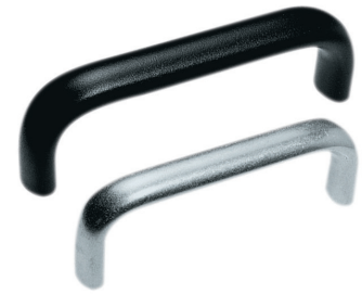
MALN - MAL