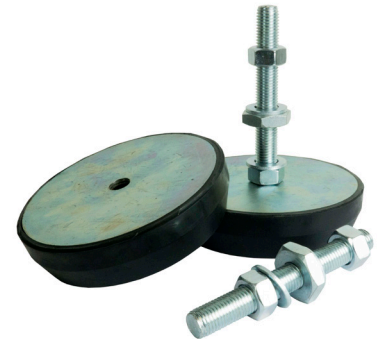
A4TC140 - A4TC160