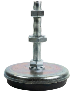
A4TC60 - A4TC70 - A4TC85 - A4TC100 - A4TC120